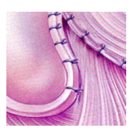
The arthroscope is used to reattach the ligaments to the socket and to tighten the loose ligaments. This is done by using arthroscopically placed sutures and suture anchors.