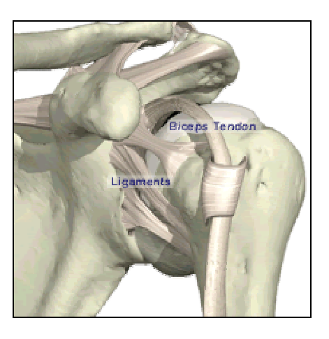
The shoulder is normally held in place by ligaments and tendons.